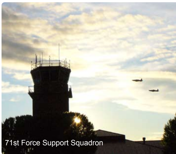
71st Force Support Squadron

71 FSS Marketing 71 FSS / FSK 400 Young Road, Suite 211 Vance AFB, OK 73705